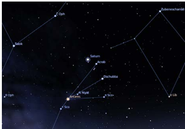
Looking south at 4 am on March 25 th

Saturn is a morning object, rising before midnight by the end of March, and shining at magnitude +0.3 . It will however be quite low in our sky, lying to the north and slightly to the west of the star Antares in the constellation of Scorpius. Saturn's north pole is tilted toward Earth, giving a good view of the ring system. Saturn's largest satellite, Titan, is due north of the planet on March 1 st , and again on the 17 th .