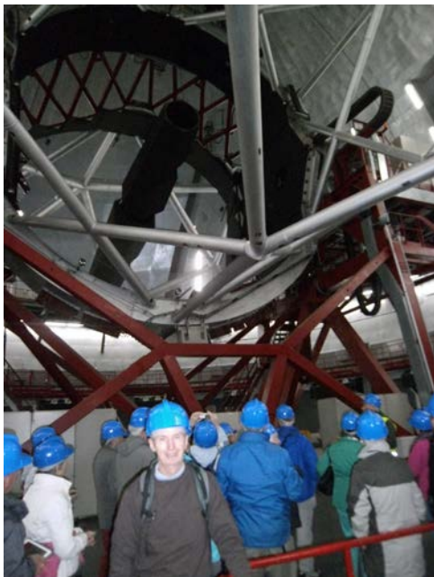
The primary mirror is visible in the background

The GTC's primary mirror is made up of 36 hexagonal segments, which when put together have a light-collecting surface area of 75.7 square metres, equivalent in size to a single circular mirror with a diameter of 10.4 metres. Six “extra” mirror segments were also made, so that any individual segment can be removed for re-aluminising and replaced immediately, without loss of a single night's observing. The re-aluminising plant is on-site, below the floor of the observatory.