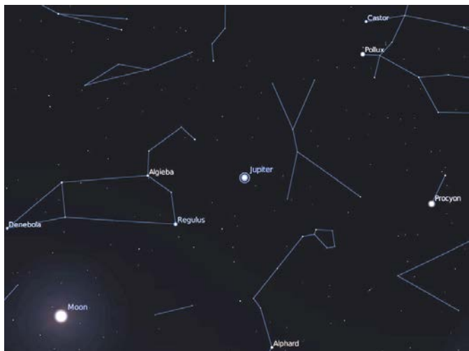
Looking south at midnight on February 6 th

Jupiter is better placed for observation this month than it will be for almost a decade. It reaches opposition to the Sun at 6 pm on February 6 th , when it will be 650 million km from Earth, and shining at magnitude -2.5 in our sky. The equatorial diameter of the planet will be 45.4 arcseconds, and the polar diameter 42.4 arcseconds, making it a compelling object for owners of telescopes.