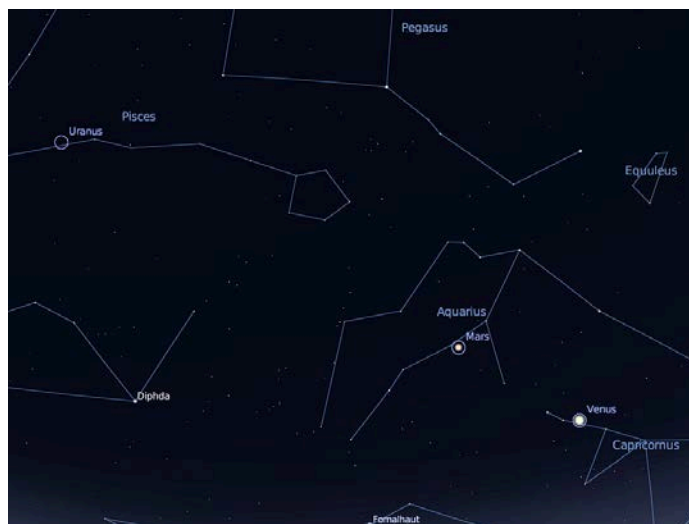
Looking south at 5:30pm on Christmas Day

Venus is on the brink of putting on a magnificent display for us as we head toward the end of the year. At the start of December it will still be 23 degrees south of the equator, but by the end of the month it will have climbed to declination -14 degrees, and will be visible for over three hours after the Sun sets. It will still be fairly low down in the south-southwest, but at magnitude -4.3 will be easy to spot in a clear sky.